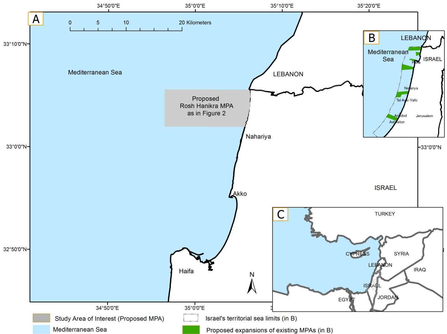
Fig 1. The area of interest (AOI): the proposed MPA. (A) Detailed view of the currently proposed Rosh Hanikra protected area. (B) The Mediterranean Sea coast of Israel with the six new and/or expanded reserves proposed by the INPA (in green). The northernmost proposed MPA is the area originally proposed for expansion by the INPA. (C) Locus map of Israel among other countries of the Eastern Mediterranean.