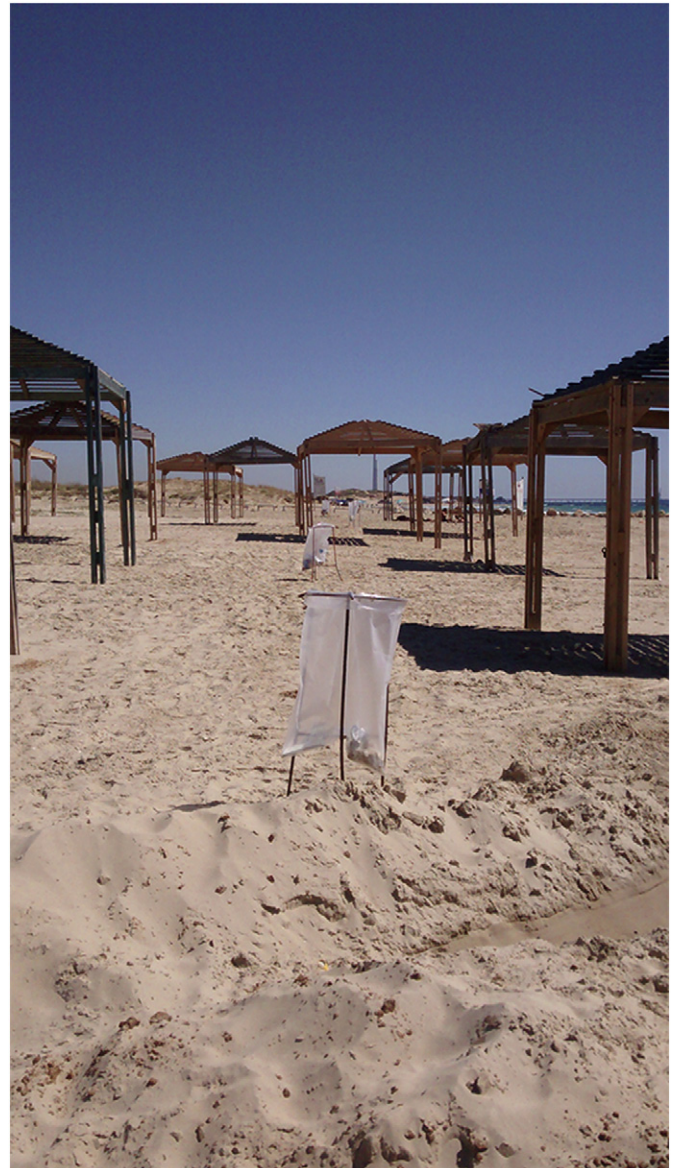
Fig. 3. New bins on the bathing beach, June 2016, Jisir-az-Zarqa.