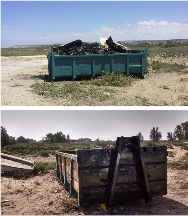
Fig. 4. INPA skip beside the fishing village – before and after.