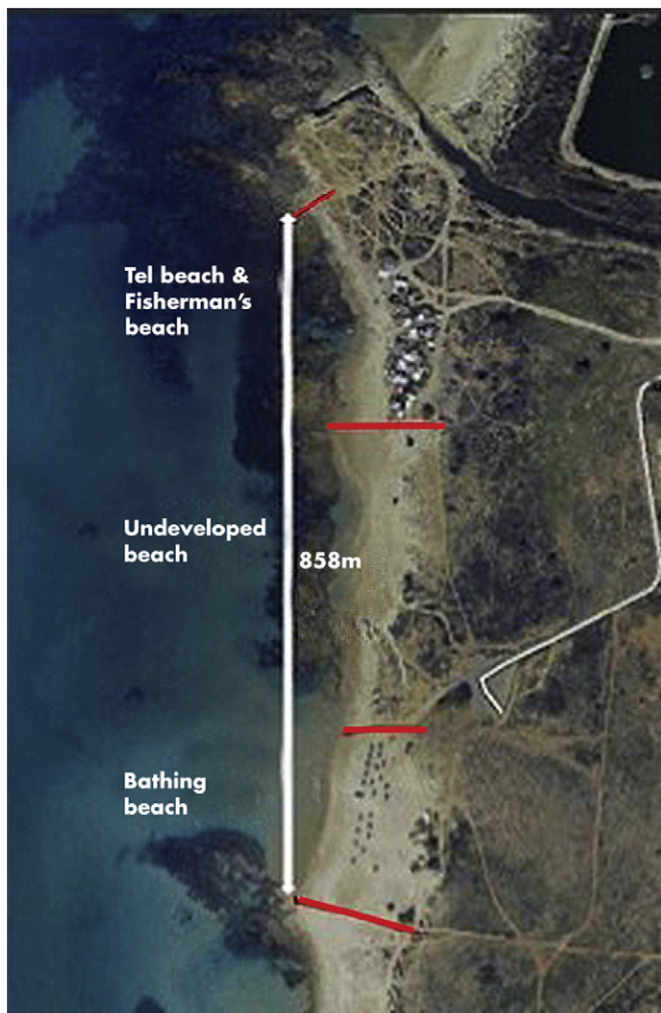
Fig. 2. The beach at Jisir-az-Zarqa divided into 3 sections: the tel (hill) and fishermen's beach, the undeveloped beach and the bathing beach. Jisir's local council is responsible for the latter. The INPA is now responsible for the first two sections of the beach. Adapted from www.govmap.gov.il

During the course of the in-depth interviews, it became clear that, until the relationships between local people and the various governing institutions are transformed, there is little hope for citizen cooperation in reducing marine litter in Jisir on a long-term basis. This is due to a prevailing worldview (and fear) within the fishing village that its improvement by an outside authority (in this case, the INPA) will inevitably lead to displacement and dispossession of the local fishermen. Understanding the fishermen's fear of the INPA requires an understanding of the wider policy context (governing system) which involves measures to improve the socio-economic status of the village, reform its waste management system and protect its coastal and marine environment. The problem of marine litter in Jisir is nested within these proposed changes since they involve improvement of the village's aesthetic appearance.