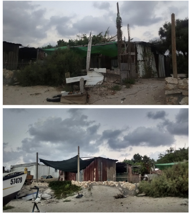
Fig. 5. Corrugated iron fishing huts, Jisr-az-Zarqa.

Hence, the State has assigned to the INPA the lead role (in terms of funding and management power) in the development and aesthetic improvement of the fishing village. Although reform of the waste management system in Jisr has been underway since early 2016, the funding is administered and tightly controlled by the regional level Haifa District Waste Management Division of the Ministry of Environmental Protection. The allocation and control of funding is an indication of where power is held. Jisr’s local council is thus disempowered in terms of